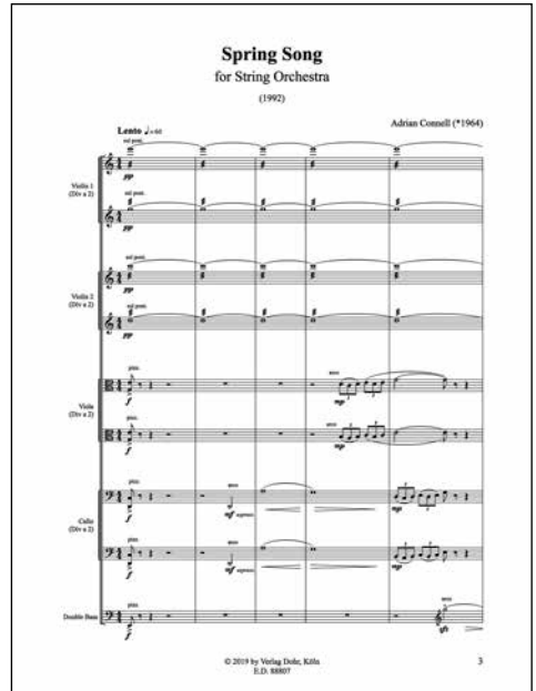
First page of the score of "Spring Song" E.D. 88807 • ISMN M-2020-9807-3